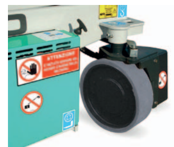
90° wheel steering