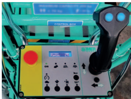
Control panel on the platform with capacitive buttons: simplicity and safety of use