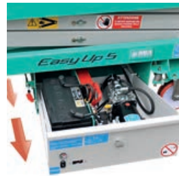
All the component parts are easily accessible for servicing.